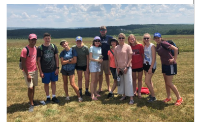
PPM team from Cherry Hill, NJ

and return to normal operations following our Covid shutdown.