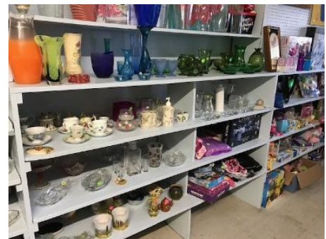
Some items on display in our new Hidden Treasures location (3643 Jacob St.)