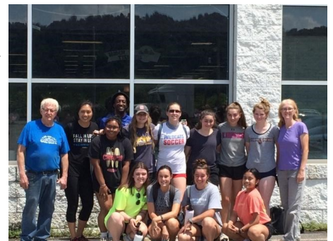
This team was from San Francisco!